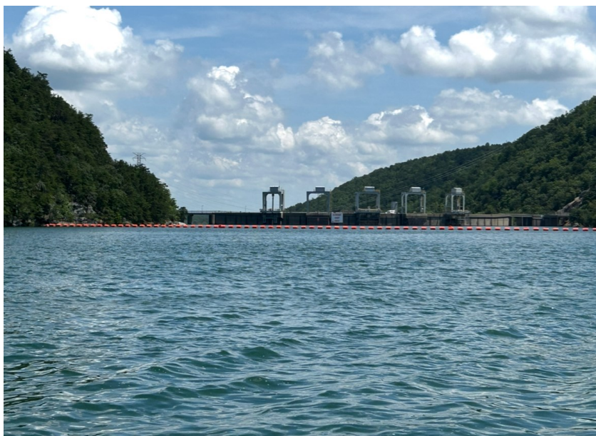
Beautiful view of Smith Mountain Lake, Virginia